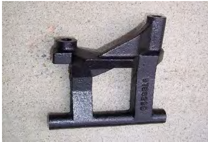
1966-68 OEM lower AC compressor bracket. 9789228. $40