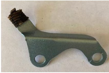
V8 OEM exhaust heat riser valve stop bracket. Attaches to the oil filter housing. $20