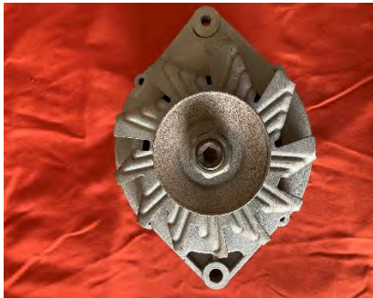
1968 GM Delco Remy 10DN alternator. Casting #1100777. 55 amp unit that has been rebuilt. $75