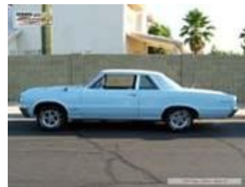
August Calendar Car